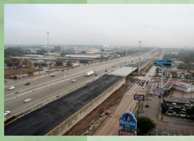
Contract D - Aerial view, looking east, of the new IH 10 eastbound mainlanes bridge over Wilcrest

The contractor has completed the reconstruction of the IH 610 West Loop mainlanes throughout the project limits. In addition, the reconstruction of the intersection at Post Oak, Woodway and Memorial were completed in December 2006. Over the last month, considerable progress was also made on the construction of the new IH 10 eastbound entrance ramp from Silber also known as the "Silber Tunnel." Currently the main focus is on completion of the IH 10 mainlanes, the detention ponds, the "Silber Tunnel", and painting. With a new anticipated completion date of May 2007, this contract is currently on schedule to be completed months ahead of the projected December 2007 completion.