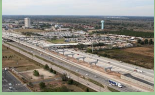
Contract C1 - Aerial view, looking west, of the new IH 10 mainlanes T-ramp to/from the SH 6/Addicks Park & Ride under construction